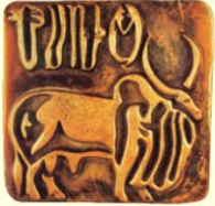
NATIONAL DAIRY DEVELOPMENT BOARD

Schooling at large is an effort to make children a success-conscious 'Yes' thinker, a dreamer...so also a doer. It goes without saying that the strength of a nation depends on the individuals and hope lies with the young minds. All of us indeed aspire to have a better child, better mind, better society ultimately a better world worth living. To fulfil our aspirations we need to improve constantly, need to advance, need to excel...and in pursuit of doing so we need inventive, innovative, creative thoughts, ideas and efforts. Children in millions are the greatest natural resource with immense potential. All of them are capable to perform excellently to build a better world. A life-meaningful, resourceful and productive, is not difficult to lead provided we allow them to experiment and explore naturally.