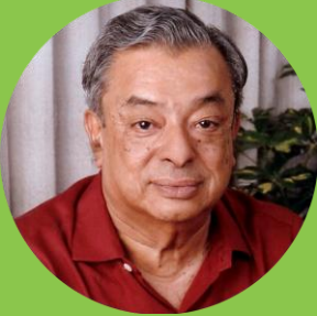
Dr Verghese Kurien

A quarterly magazine of Anandalaya April 2018 – June, 2018 : Issue - 4